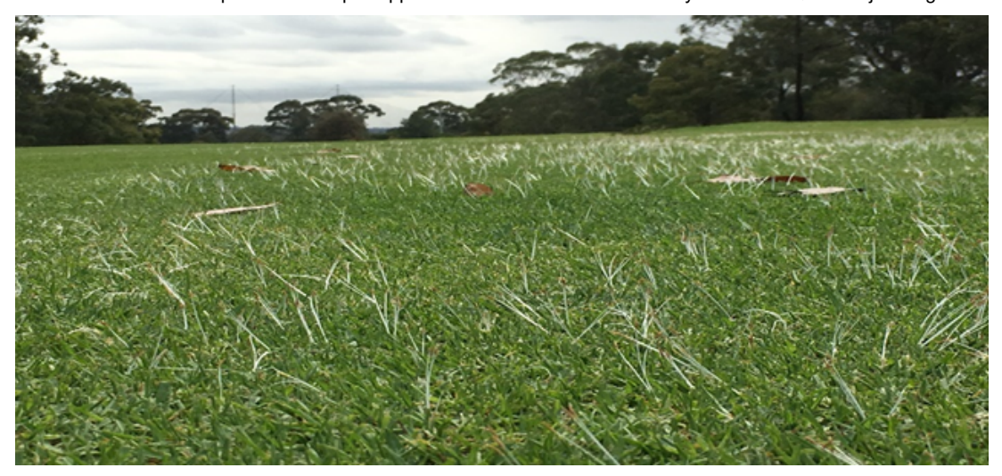
MEET THE MAINTENANCE STAFF